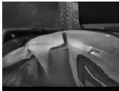
Figure 2: FCM Image, “At-Event.”