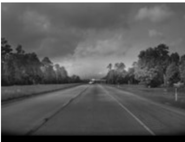
Figure 1: FCM Image, “Pre-Event.”

Figures 1-3 are the images captured by the FCM of the Chevrolet® Equinox® SUV. 1