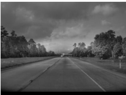
Figure 4: FCM Image, “Pre-Event” with Ford® F350 pickup visible (446 feet from impact).

Figure 4 is the FCM Image, “Pre-Event” enlarged to show the Ford® F350 pickup in clear view. This image was taken approximately 4.0 seconds prior to the impact.