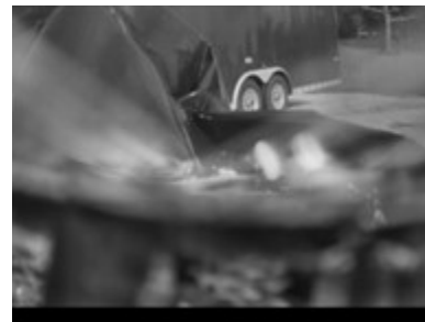
Figure 3: FCM Image, “Post-Event.”

Figure 4 is the FCM Image, “Pre-Event” enlarged to show the Ford® F350 pickup in clear view. This image was taken approximately 4.0 seconds prior to the impact.